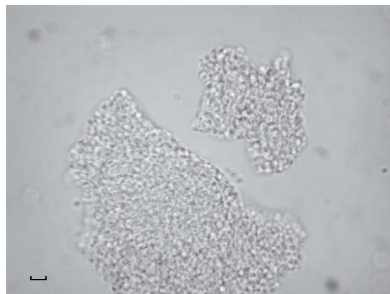
Figure 1. Light microscopy of wet \beta -glucan material obtained after alkaline isolation (magnification 400 \times , bar = 1 \mu m)

The choice of drying method is very important for particle dimensions, their structure and biological activity (Hromádková et al., 2003). Spray-drying keeps biological activity of \beta -glucan to a greater extent and has advantage in comparison with air-drying and lyophilization. Air-drying of sonicated \beta -glucan from baker's yeast leads to reaggregation. But, sonication applied prior to spray-drying enables production of fine powder with few small aggregates (Hunter et al., 2002). In our work, similar sonication procedure was combined with spray drying, resulting in a fine non-aggregated powder. Due to very fast water