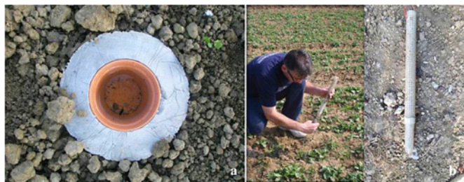
Figure 3. Epigeic pitfall trap (a) and endogeic trap (b) in oilseed rape crop (Juran)