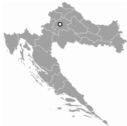
Figure 1. Map of Croatia with the marked point that designates the area of the Šašinovečki Lug, Greater Zagreb, Croatia, as the locality at which the ground beetle species were recorded

Ground beetles were sampled in three winter oilseed rape fields of approximately 1 ha each between October 5, 2010 and June 30, 2011 in winter oilseed rape crop (conventional, integrated and organic), then during fallow period from June 30 to October 18, 2011 and lastly in the succeeding crop of winter wheat (conventional, integrated and organic) from November 16, 2011 to June 20, 2012. Fields were located at Šašinovečki Lug, near the city of Zagreb (GPS coordinates 45°5'43''N, 16°11'47''E) (Figure 1).