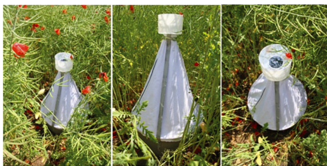
Figure 4. Emergence traps with photoelectors on top in oilseed rape crop (Juran)

inner cup was without drilled holes in the bottom. The plastic cup was positioned in the soil on a round holder (ring) so that the upper edge was in line with the soil surface.