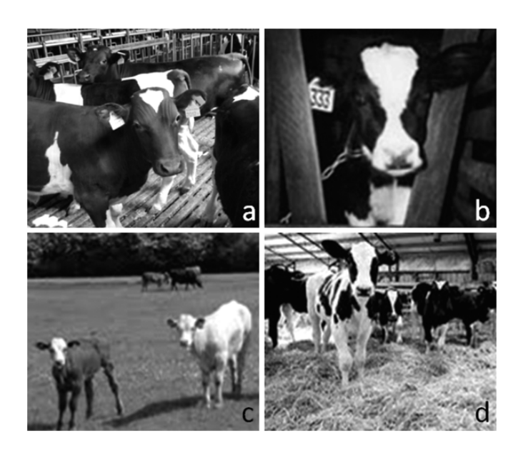
Figure 1. Veal calves fattened in small groups (a), in traditional individual cages (b), on pasture (c), in large groups on straw (d).

First a descriptive analysis of the items was drawn up to assess response frequencies and to describe respondents' socio-demographics. Cronbach's alphas were analyzed in order to evaluate the internal consistency among respondents and Spearman rank correlations were investigated. One-way nonparametric tests were performed for location differences of consumption, purchase and purchase frequency across gender, age, educational level, residential area, household size and composition.