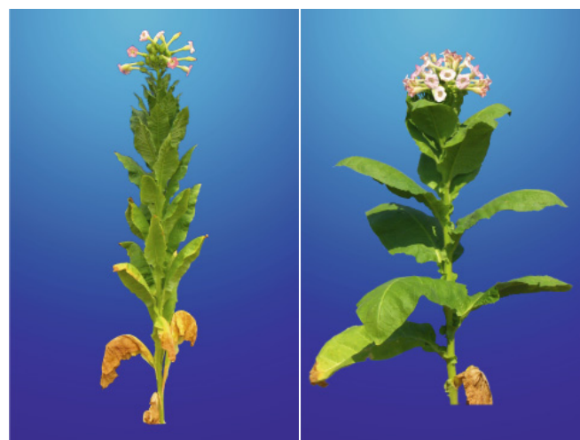
Figure 3. Yaka YV 125/3