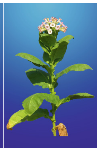
Figure 4. Forchheimer Oгородный FO

Average temperature in this period was 19.4°C and total amount of precipitations was 164.1 mm.