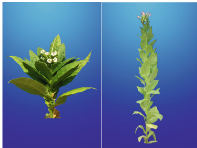
Figure 1. Prilep P 12-2/1

The trial was set up in 2006 at the field of Tobacco Institute - Prilep in randomized block design with four replications. The total experimental area was about 940 m 2 , i.e. 235 m 2 for each replication. In the period of growing, all suitable cultural practices were applied, including digging, nitrogen fertilization, two irrigations and preventive protection from pests and diseases.