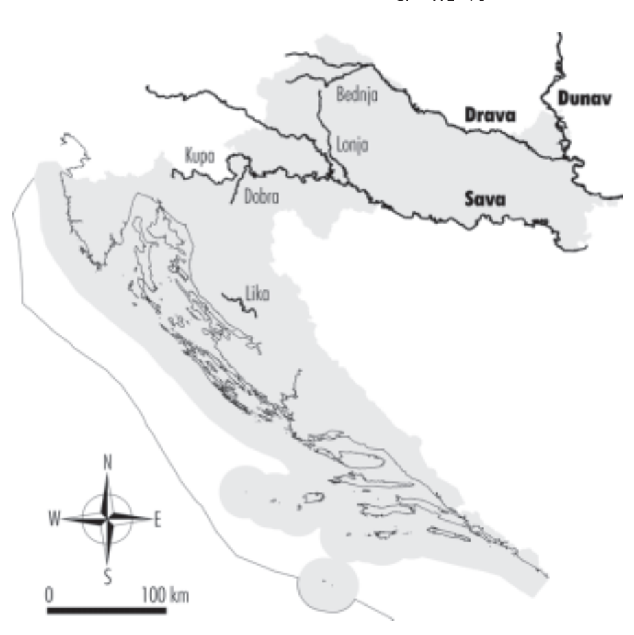
Figure 1. The locations of investigated rivers