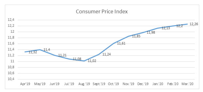
Figure 1. Nigeria's Consumer Price Index CPI Growth from April 2019 to March 2020.

Consumer Price Index (CPI), which measures changes in the prices paid by consumers for a basket of goods and services, has changed drastically between December 2019 and March 2020 (See Figure 1). Data from the National Bureau of Statistics (NBS) revealed that Nigeria's inflation rate increased by 12.20% (year-on-year basis) in February 2020. This is 0.07% higher than the rate of 12.13% recorded in January 2020 and the highest rise since April 2018. On a month-on-month basis, it increased by 0.84 percent in March 2020, which is 0.05 percent higher than the 0.79 percent recorded in February 2020. According to the report, the food index rose from 14.85% recorded in January to 14.9% in February 2020.