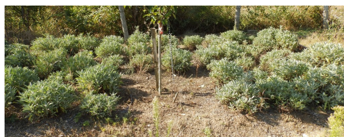
Figure 4. General view of S. officinalis experimental plants (conventionally derived plants on the left half, hydroponically derived plants on the right half).