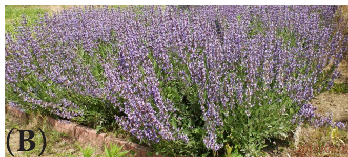
Figure 5. Conventionally (A) and hydroponically (B) derived plants during the full flowering stage in their second year on the experimental field.