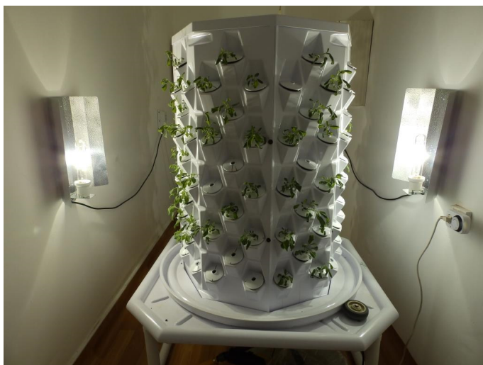
Figure 1. Vertical aero-hydroponic system Green Diamond (GH) with 5-week old seedlings of S. officinalis

Seedlings' growth was rapid and at the age of three months the average plant height was 23.9 \pm 2.5 cm and about \frac{1}{4} of all 80 plants had formed branches of second rank (Table 1).