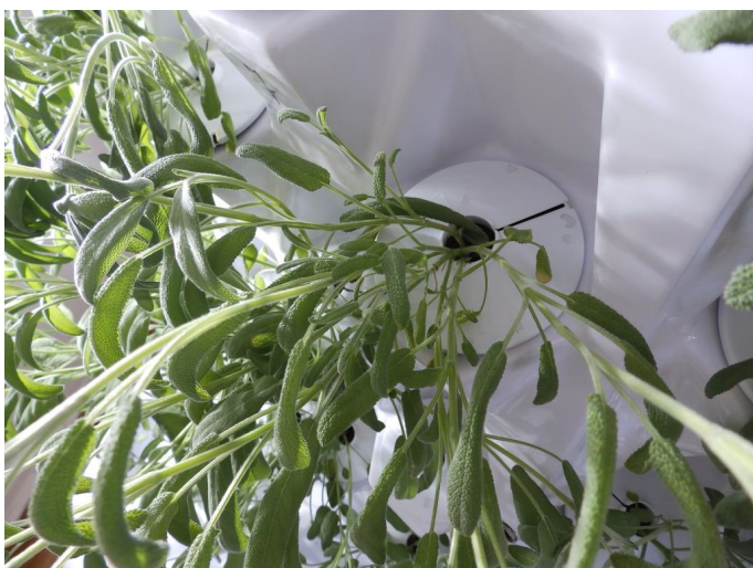
Figure 3. Ramified 10-week old seedling of S. officinalis obtained by soilless cultivation with branches of first and second rank