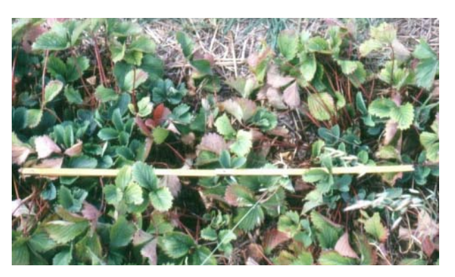
Figure 1. Wilting symptoms in strawberries infested by Verticillium dahliae ; wilting of the older, outer leaves; the young leaves remain stunted