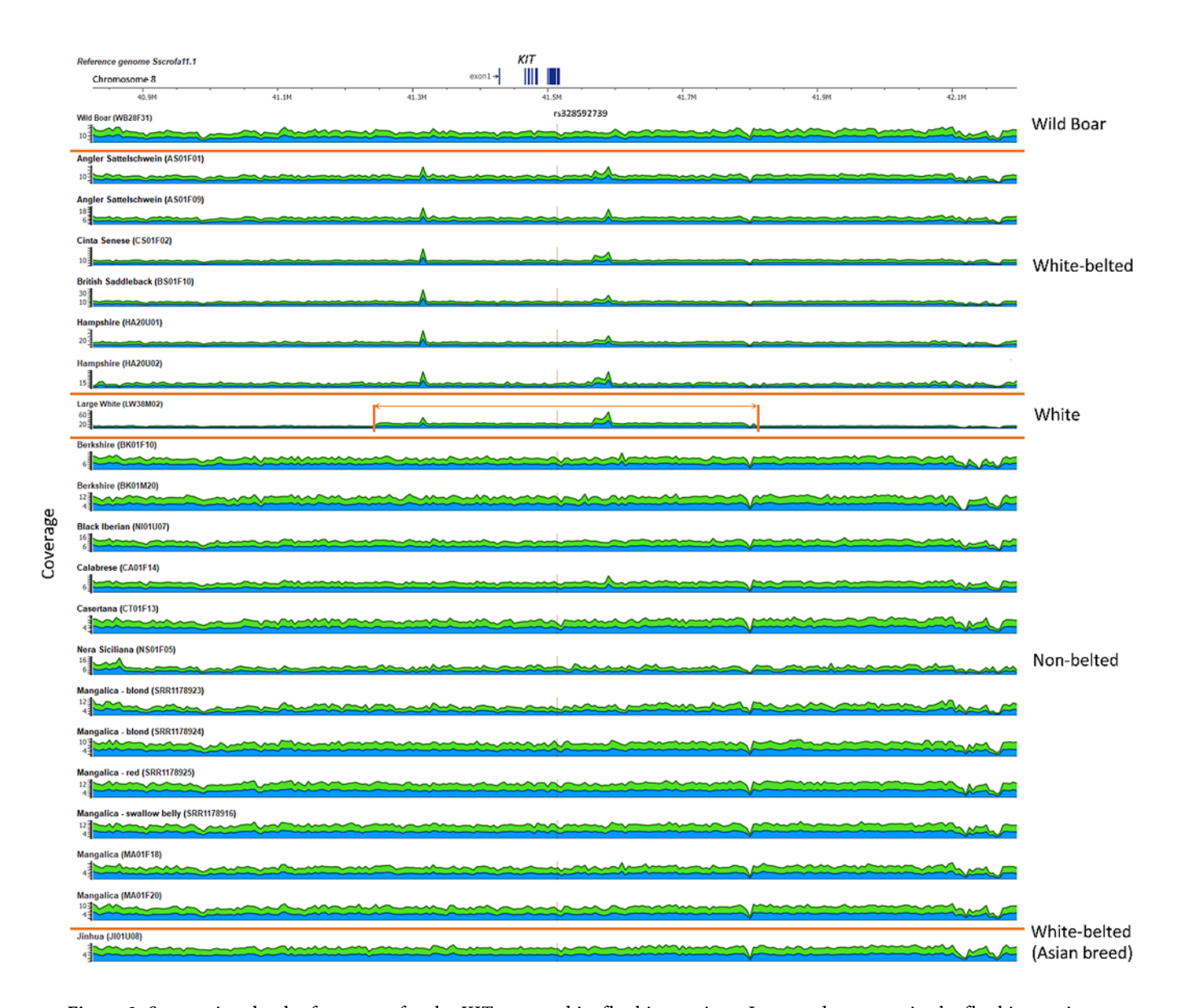
Figure 2. Sequencing depth of coverage for the KIT gene and its flanking regions. Increased coverage in the flanking regions of the KIT gene indicates the presence of duplications. Increased coverage in upstream region of the gene KIT is present in belted and white pigs included in the analysis. Increased coverage of large region which includes entire KIT gene in White Large pig indicates the duplication of the region (arrows show the beginning and the end of the duplicated region), while the reference genome originates from a Duroc pig with a single copy of KIT .

Analysis of the wider genomic region containing KIT locus revealed an increased depth of sequence coverage in two regions close to the KIT locus (Figure 2). The first region with the increased depth of coverage appears in the belted and white animals only and is located on the chromosome 8 between 41290130 and 41294451 (Sscrofa 11.1 assembly). The length of the region